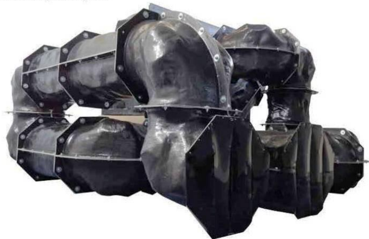
CAVE FAST: 600mm - T Piece